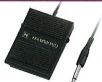
■ FS-9H Foot Switch