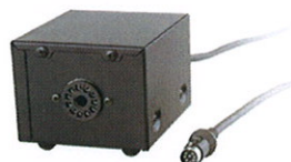
■ XLD-811 Leslie Adapter Mini 8 pin to 11 pin