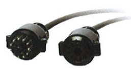
■ LC-11-7M 11pin Leslie cable 7m(23ft)